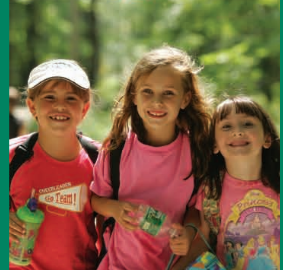
CS Kansas City Corp. Lakeland Charities Mortimer Levitt Foundation United Way of Sussex County