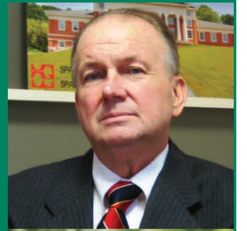
Selective Insurance Group, Inc. YMCA of the USA